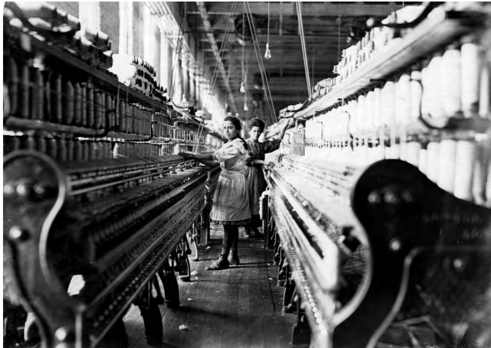
“Spinner in Bibb Mill No. 1, Macon, Georgia. Bad lighting and ventilation in spinning room.” (January 1909) A spinner walked the long aisles, brushing lint from the machines and watching spools for breaks in the cotton thread. Once they found a break, they tied the ends together. Spinners were on their feet working 10 to 12 hour shifts, six days a week.