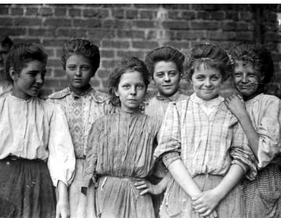
"Some adolescents in an [unspecified] Georgia Cotton Mill, January 1909."

feet, dressed in coveralls, while others feature children seemingly freshly scrubbed and wearing fine outfits. Since photography was still very much a novelty at the time, parents aware that their children were to be photographed undoubtedly dressed them for the occasion.