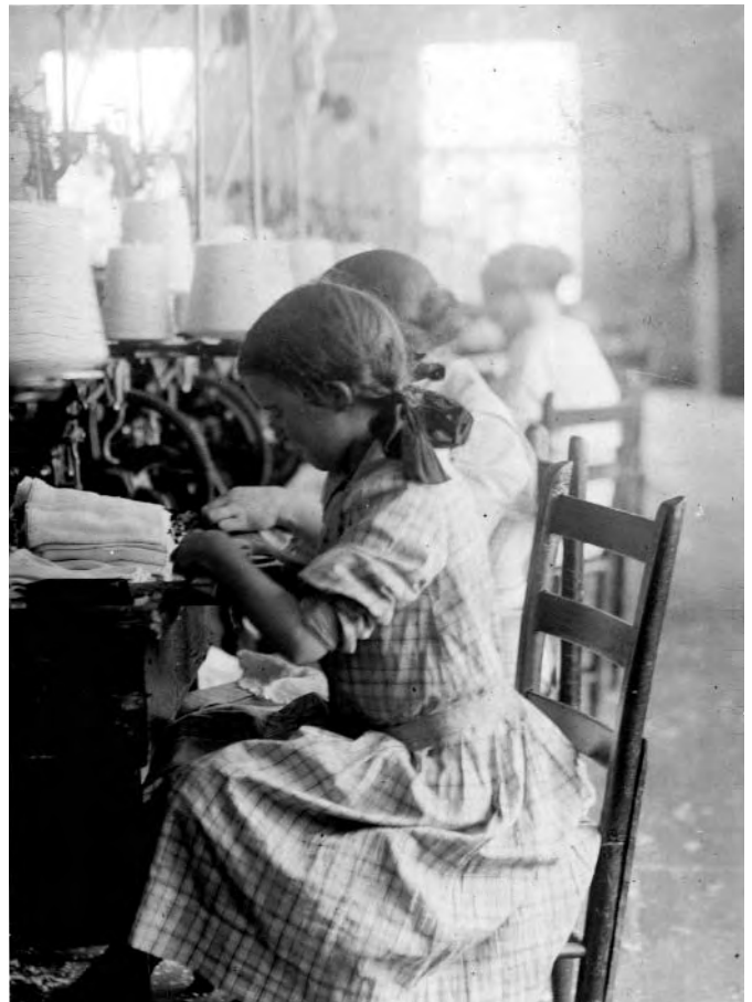
"Topper at her machine, Walker County Hosiery Mills, Lafayette Ga." (April 1913)