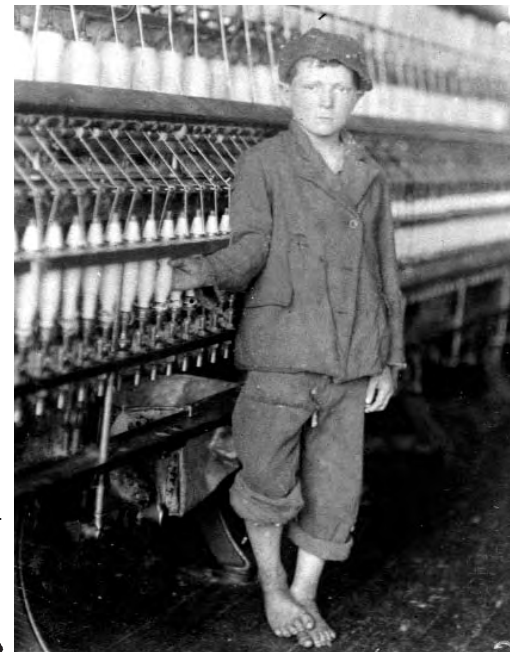
A young doffer boy beside a machine in Massachusetts Mill, Lindale, Georgia (April 1913). Once a bobbin was filled with newly-made thread, a doffer removed it and replaced it with an empty spool. Boys as young as seven years old were employed as doffers.