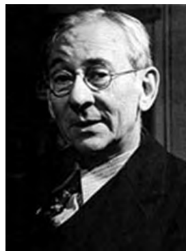
L.W. Hine (1874-1940)

“Another ‘Dependent Father.’ He is so recorded in the Ordinary’s office where he made application for his minor children to work. He has three children in the mill. When he married [his] present wife, she brought with her seven children, three of which are in the mill. The mother and father are both in mill work. He works part of the time. Lyell, Columbus and Swift Mills, Columbus, Georgia.” (April 1913)