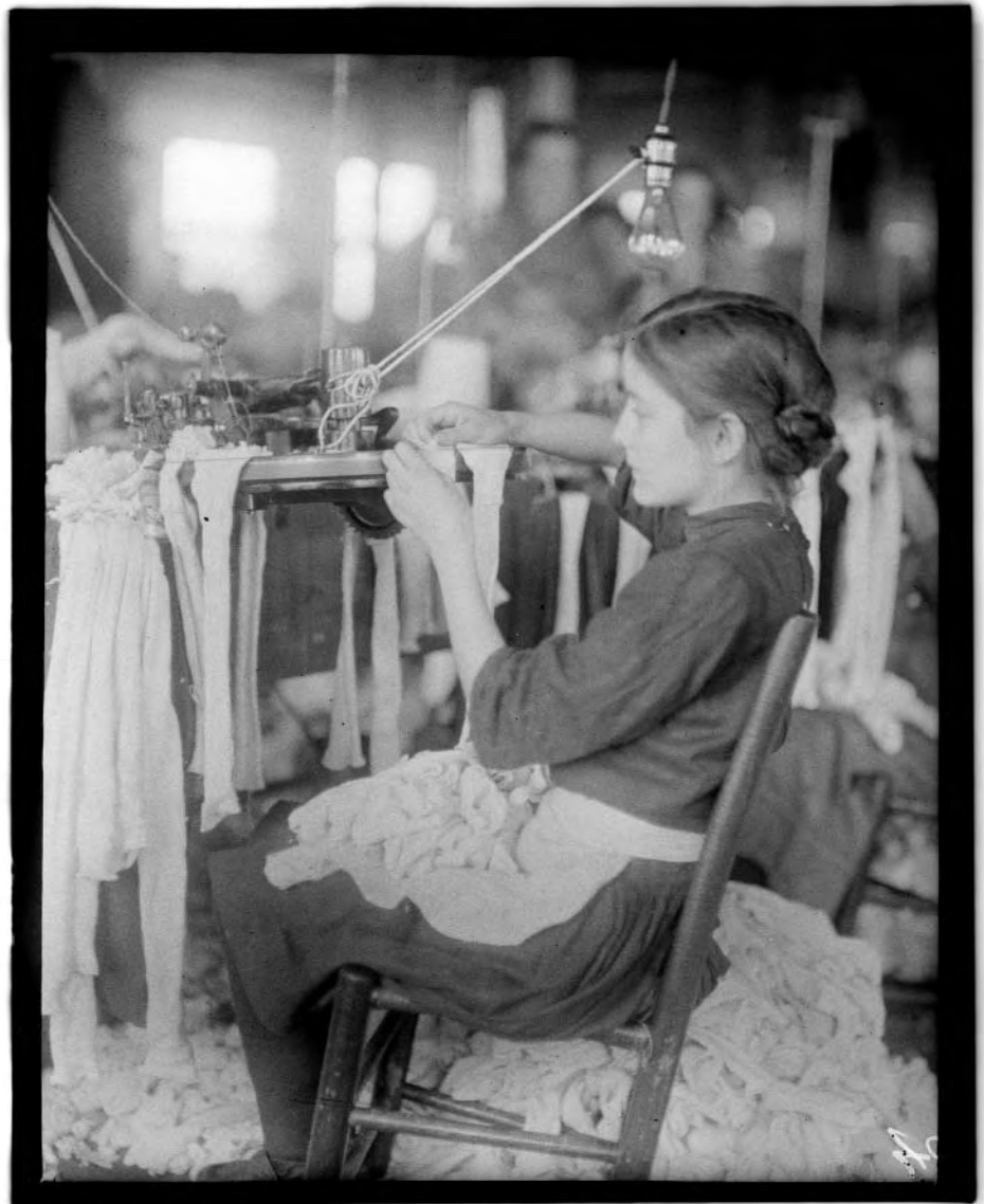
LEFT AND BELOW: "All these are workers in the Cherokee Hosiery Mill, Rome, Ga. Noon, April 10, 1913," Hine noted for the caption. "The youngest are turners and loopers. Other Hosiery Mills around here employ children of 8 and 9 years. Some of these appear to be as young."

Thanks in no small part to Hine's work, in 1916 Congress enacted the Keating-Owen Act that restricted employment of children under 14 in industry. "The work Hine did for this reform," said the chairman of the National Child Labor Committee, "was more responsible than all other efforts in