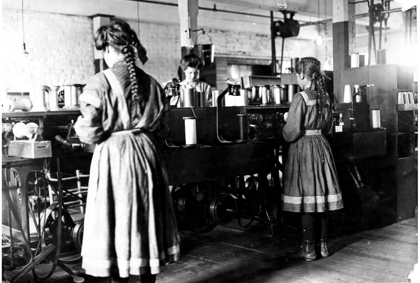
"In the spool cotton dept. Bibb Mfg. Co., No. 1, Macon, Ga. Jan. 19, 1909."