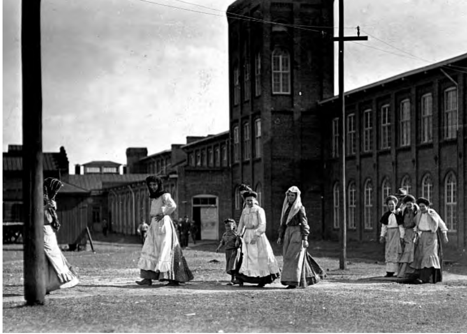
Noon hour at Manchester Cotton Mill, Macon, Georgia, January 1909.