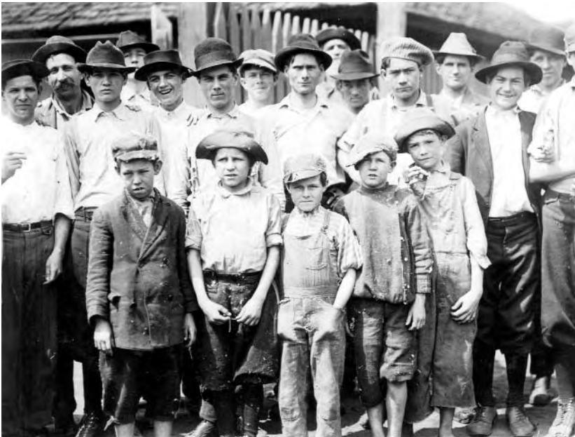
Noon hour at Massachusetts Mill in Lindale. "During the days following this," Hine noted, "I proved the ages of nearly a dozen of these children, by gaining access to Family Records, Life Insurance papers, and through conversations with the children and parents, and found those that I could prove to be working now, or during the past year at 10 and 11 years of age, some of them having begun before they were ten. Further search would reveal more." (April 1913)