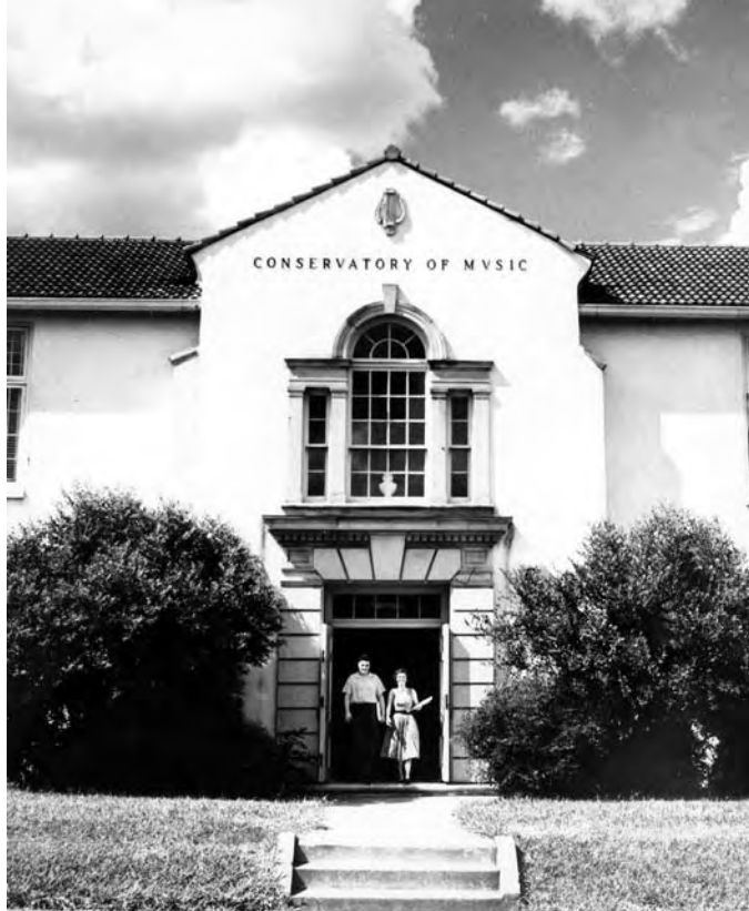
The recital took place at the Birmingham Conservatory of Music, pictured here circa 1945.

same with me, which I found to be helpful and reassuring. She was gentle but firm, and always insisted that I practice one hour immediately after coming home from school. (This rule no doubt saved the life of many a crawfish in our neighborhood creek.)